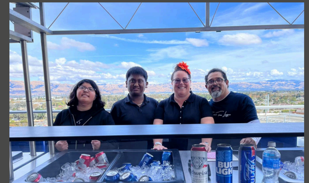
49ers Game for the Coach Sarna League