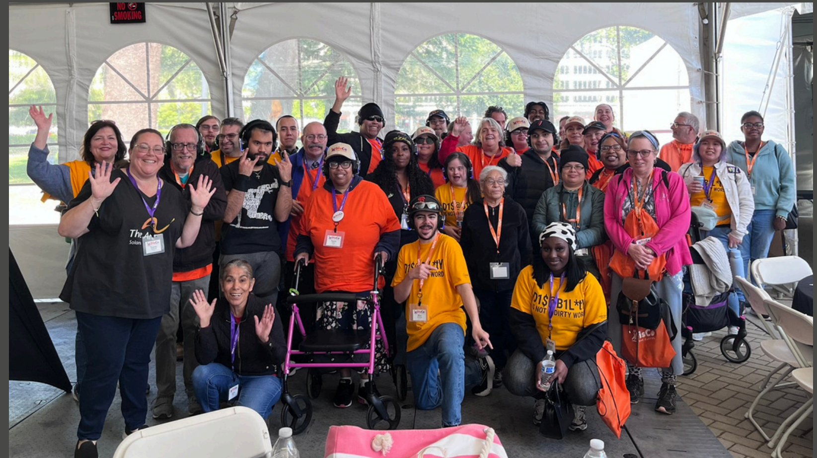
DisCo at the Capitol