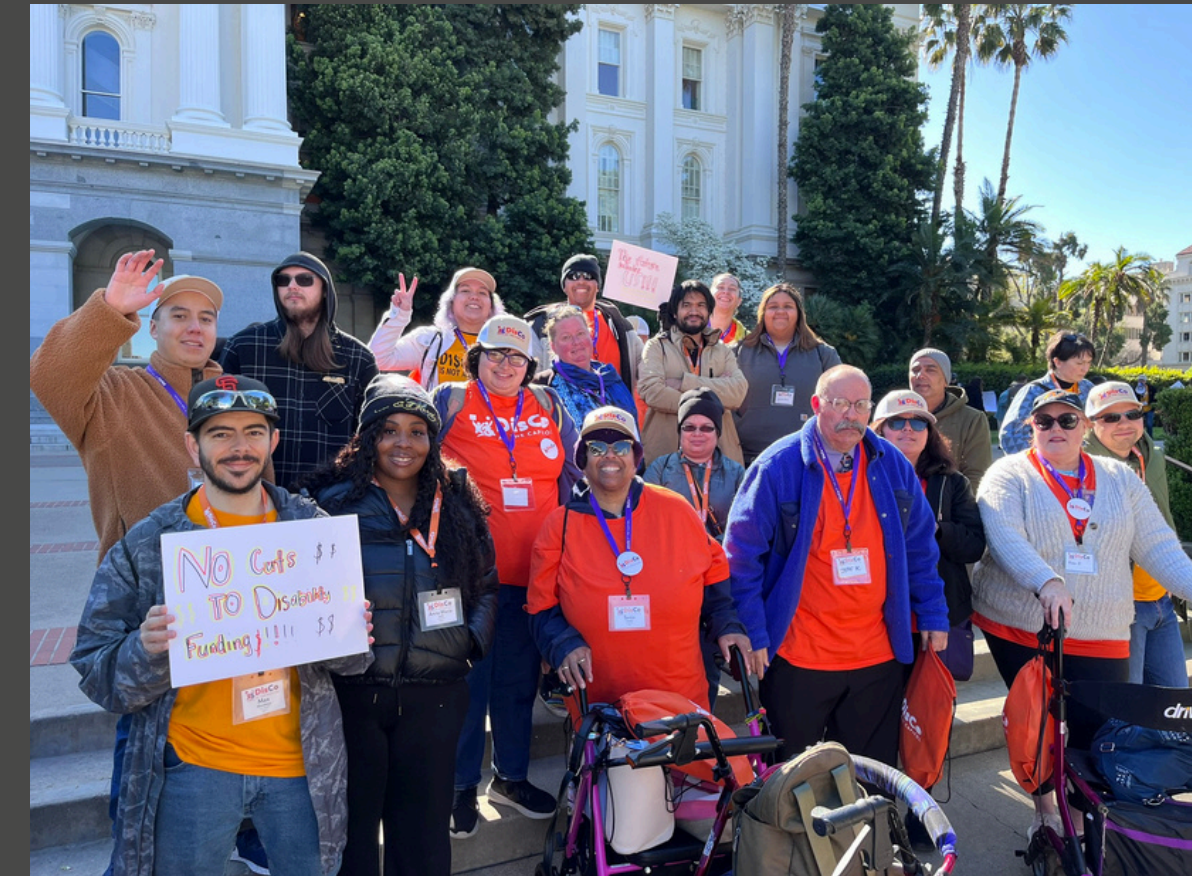
DisCo at the Capitol: Advocacy Day