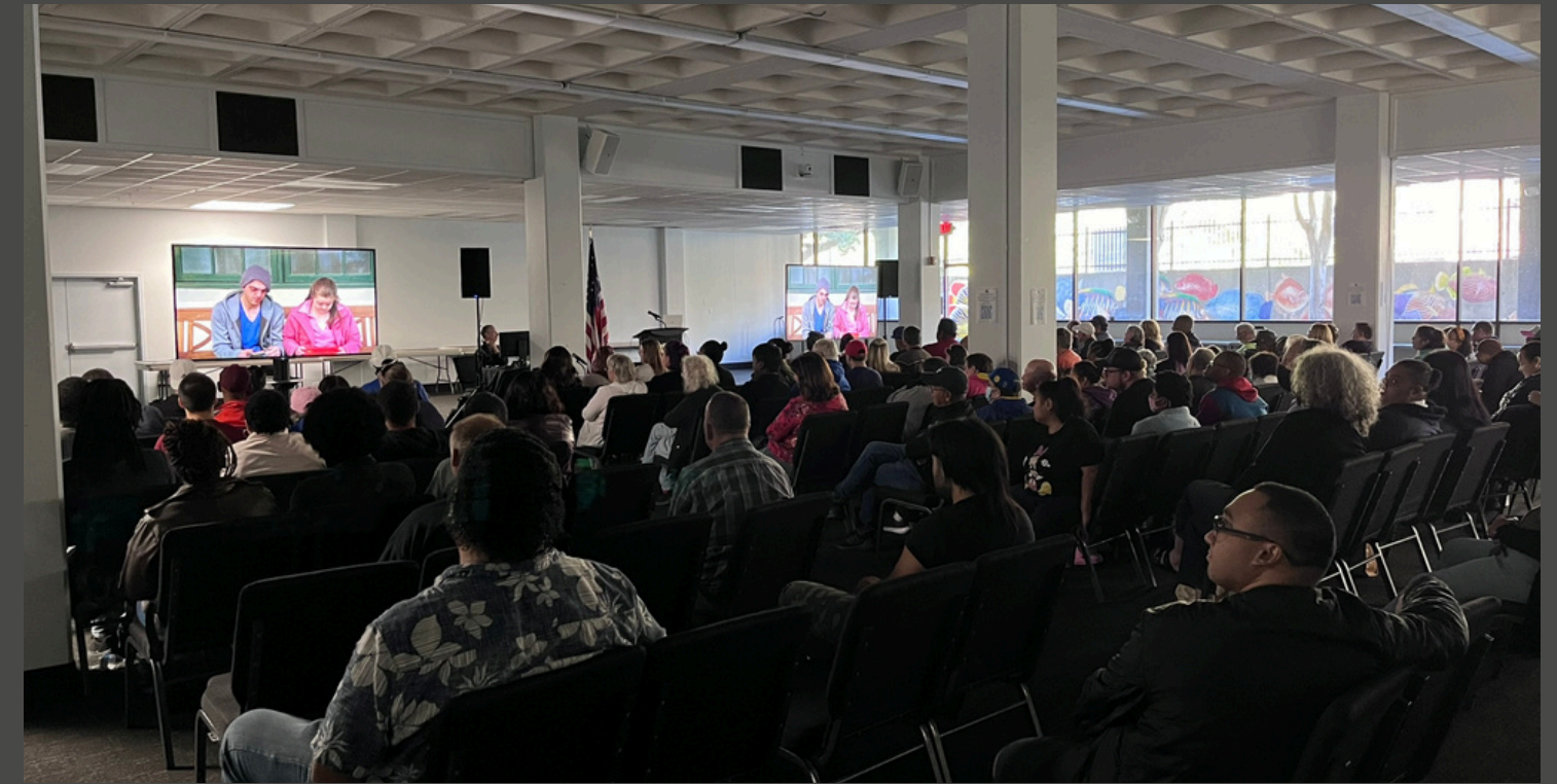
Sprout Film Festival