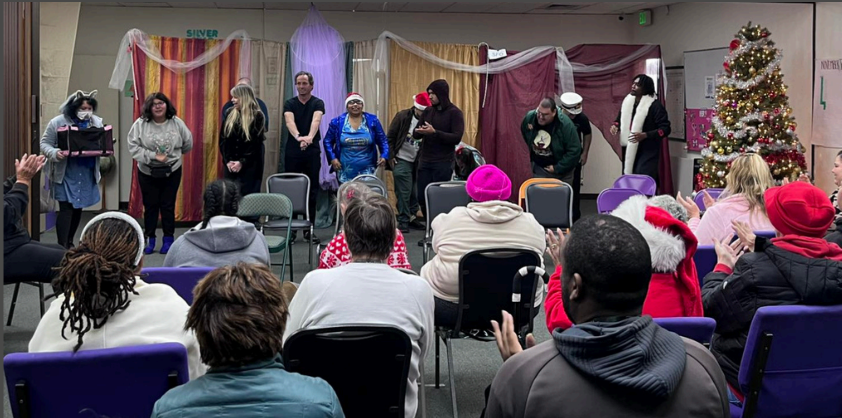
Theater Production at the ACT/TDS Holiday Feast