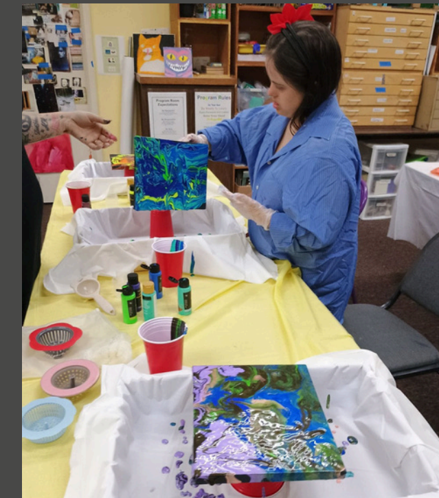
Client-Led Art Class