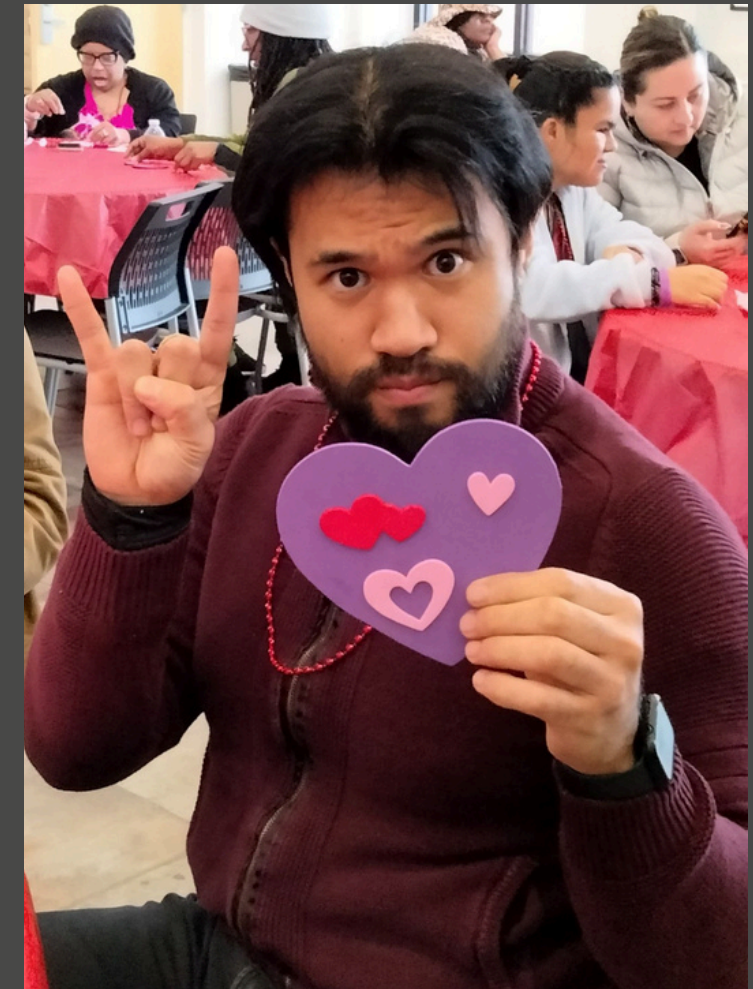
GVRD Valentine's Dance