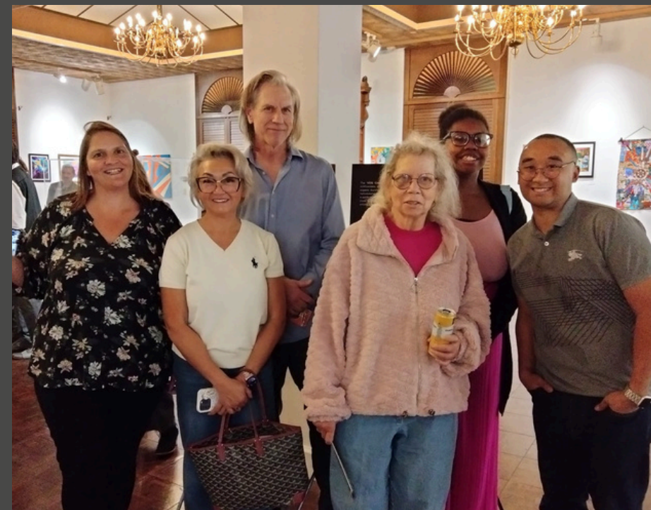
Artists' Reception at Vallejo Open Studios