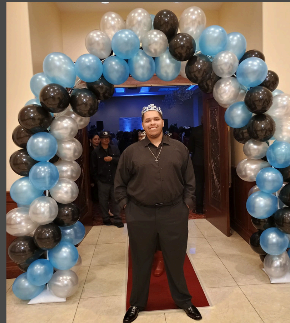
Night to Shine Prom