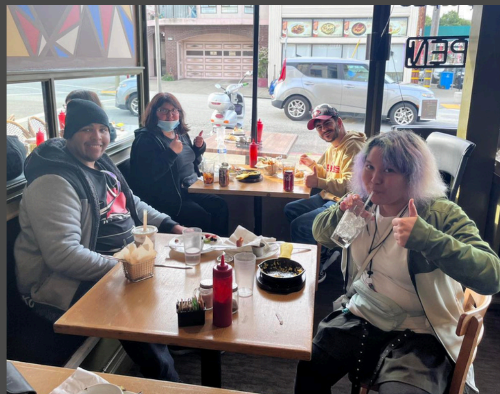
De Young visit to the Tamara de Lempicka exhibit & lunch