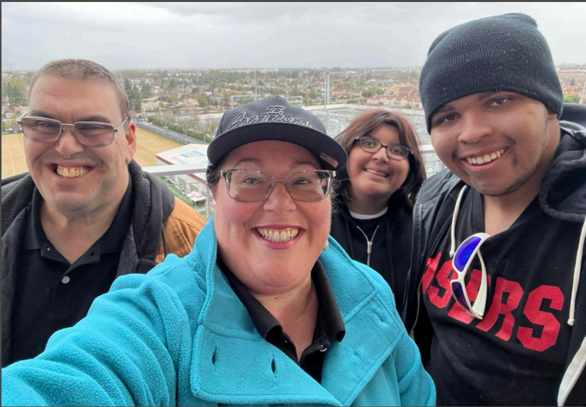
MORE volunteering with the Coach Sarna League