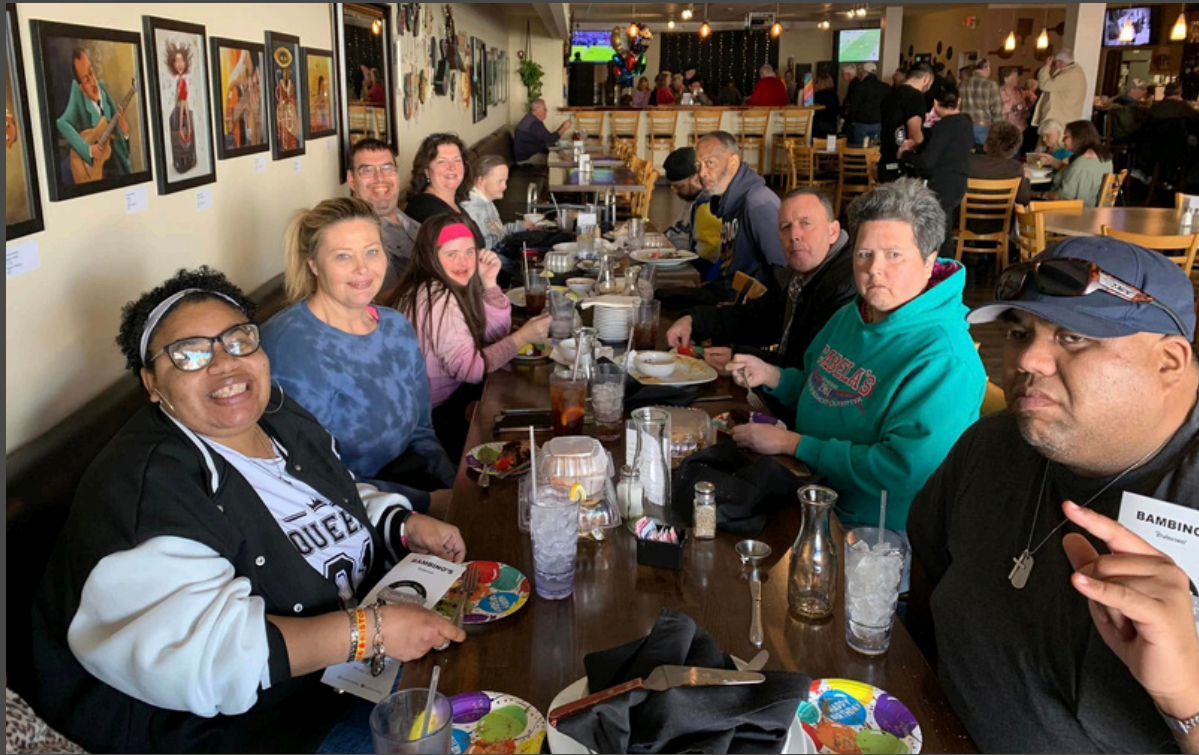
Dine-In Fundraiser for The Arc-Solano at Bambino's Vallejo