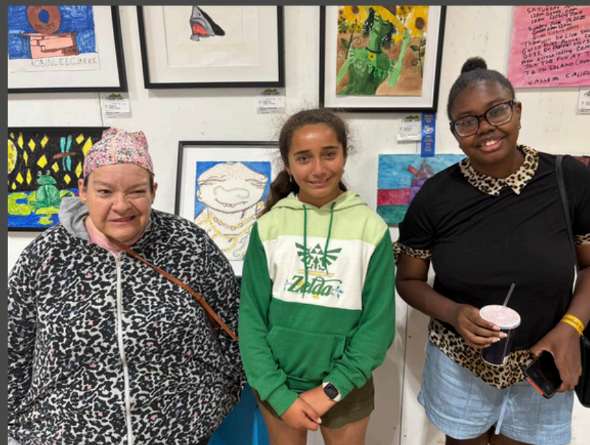
Solano County Fair First Place Winners