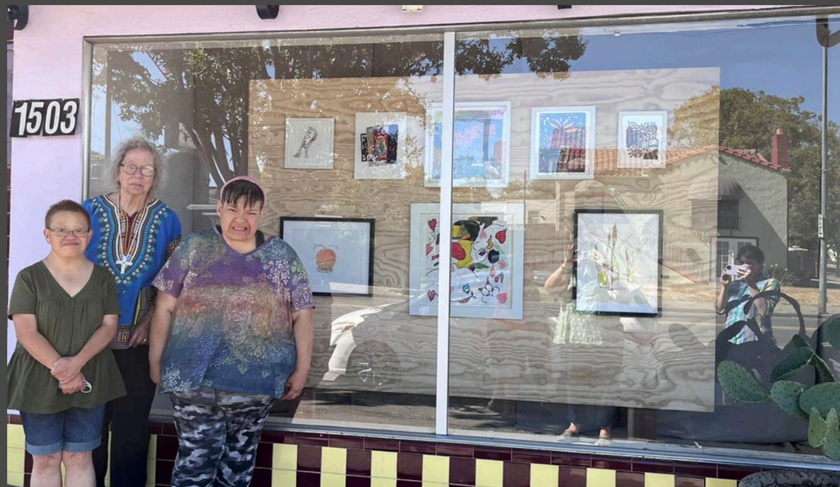
Art@Arc Show at Personal Space Gallery