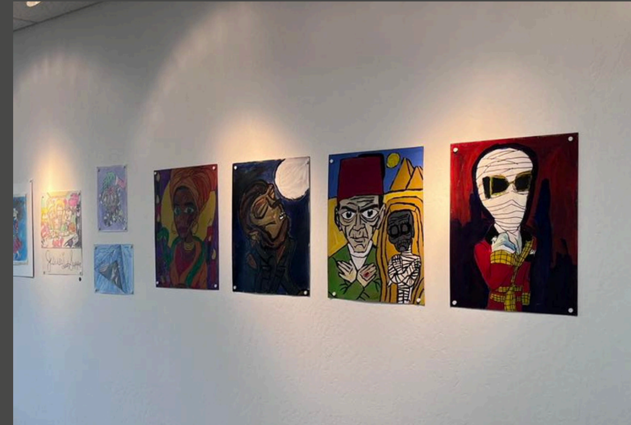
Art@Arc participated in the 2025 Vallejo Open Studios Exhibit!