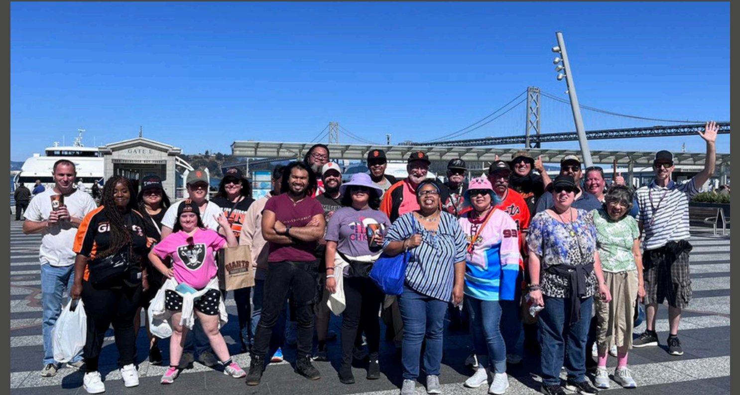
SF Giants Game & Ferry Ride