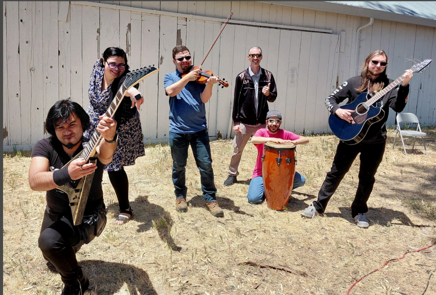
Rush Ranch BBQ & Talent Show