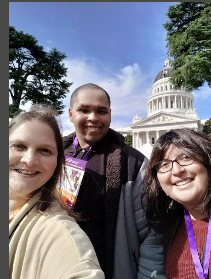
DisCo at the Capitol: Advocacy Conference