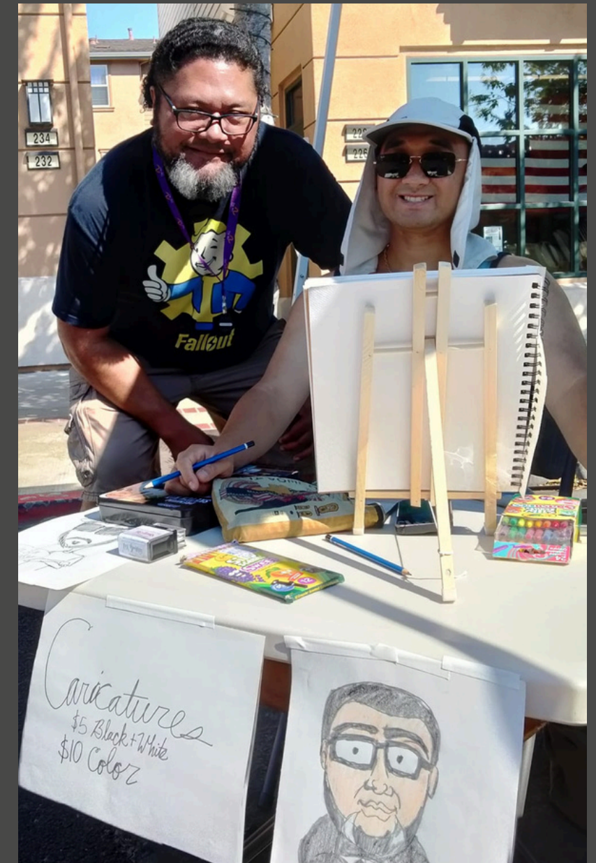
Drawing caricatures at the Benicia Farmers Market