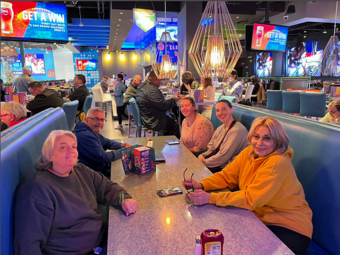
TS Holiday Outing to Dave & Busters