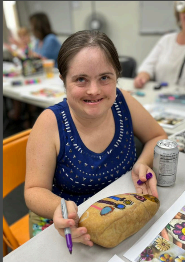
Rock Painting Party Fundraiser