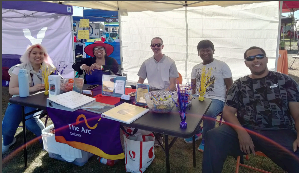
Waterfront Weekend Volunteering