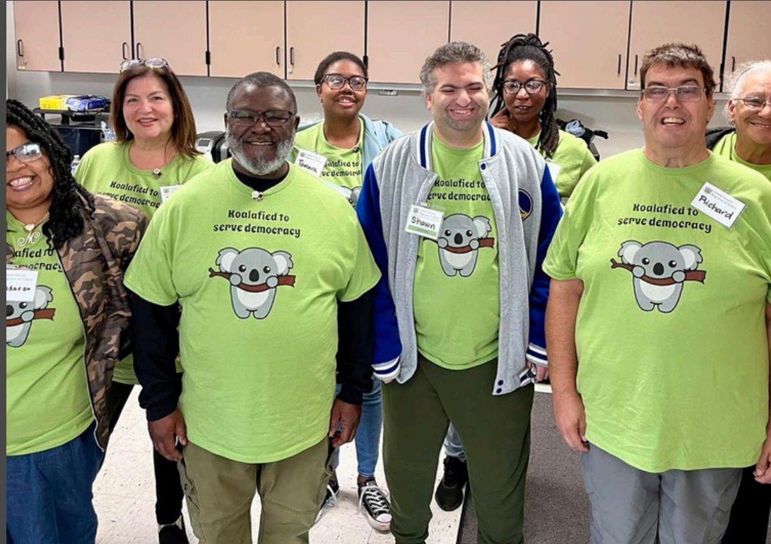
We adopted Rodriguez High School Polling Location in Fairfield for the 2025 Election!